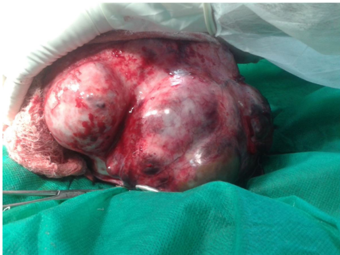
Figure 2. Surgical resection and macroscopic appearance of the right kidney.

Limited data exist on the prognosis of dogs with nephroblastoma. In one study, dogs with extrarenal nephroblastoma (string spinal) that underwent surgical treatment and radiotherapy lived for 374 days on average; those receiving average palliative treatment survived only 55 days (Liebel et al., 2011).