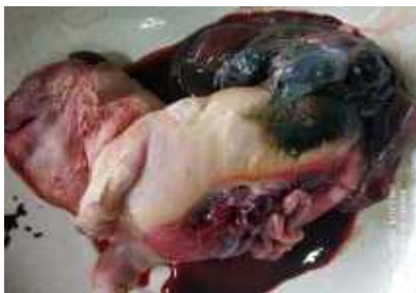
Fig. 2: Gigantic water puppy with visceroptosis of thoracic and abdominal cavity

ligated separately using Catgut no. 1 and severed. The cervical end of the uterus was ligated and transfixed using Catgut no. 1 and dissected. The incised muscle and peritoneum were sutured using Vicryl® no. 0 by continuous interlocking pattern. Suturing of subcutaneous tissue was done using Vicryl® No. 0 by simple continuous pattern and the skin incision was closed using Trulon® No. 0 by cross mattress suturing pattern. Post operative antibiotic using Sporidex® @ 20-25 mg/kg B.W. bid was administered for 7 days alongwith alternate days wound dressing. The animal had uneventful recovery and the skin sutures were removed on day 10 post operation.