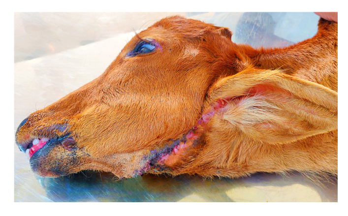
Figure 3. The calf after the removal of skin stitches on the 14th postoperative day.

to prevent myiasis, and proper hygiene of the animal shed was ensured.