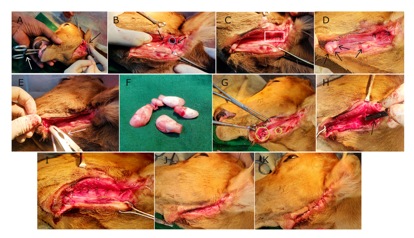
Figure 2. Various phases of RS for OCF complicated with EIs in the calf. (A) Insertion of curved intestinal forceps (white arrow) through mouth and suturing the hole (black arrow), (B) closure of the defect (blue circle) accompanied by two edge supporting stitches (black arrows), (C) second layer closure with interrupted sutures (white rectangle), (D) EIs (black arrows): three cranial and one caudal, (E) application of dental forceps (white arrow), (F) extracted EIs, (G) closure of dental sockets (yellow circles), (H) scratching of the linear tract with scalpel (black arrow), (I) initial closure of the tract, (J) closure with intradermal suture, and (K) final closure with interrupted sutures.