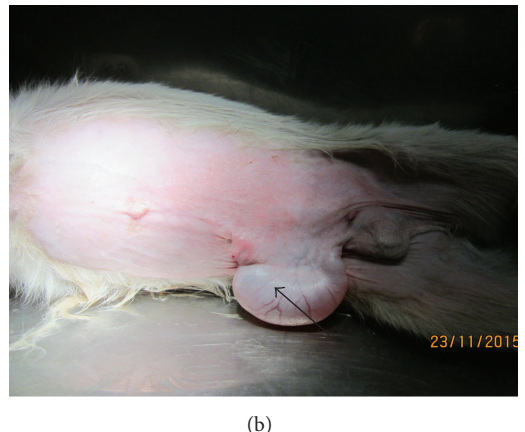
FIGURE 1: (a) Prescrotal pocket (arrow). (b) Prescrotal pocket.