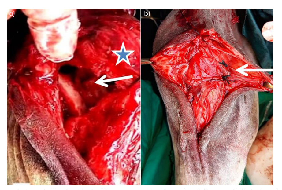
Fig 3: a) Intraoperative photograph showing the trochlear groove after deepening (white arrow). Note the released patella (star). b) Intraoperative photograph showing the medial imbrication of the stifle joint capsule (white arrow).

bear weight on its right hindlimb at walking, preservation of the range of movement and no evidence of the patellar reluxation or lameness.