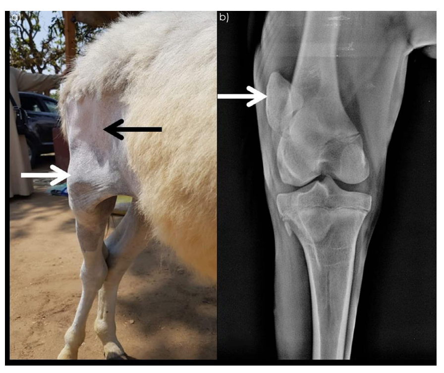
Fig 1: a) A 6-month-old female donkey foal with right lateral patellar luxation showing atrophy of the thigh muscles (black arrow), swelling of the right stifle joint and site of patellar luxation (white arrow). b) Caudocranial radiographic view of the right stifle joint of the same donkey foal showing the luxated patella (white arrow).

technique using a combination of 1 g of ketamine HCl, 0.5 g of xylazine HCl and 1000 mL of 5% guaifenesin solution. This combination was given to effect up to a rate of 2 mL/kg per hour.