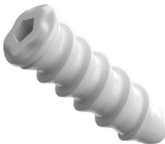
Fig. 2. Helysis PLDLA- \beta TCP interference screw