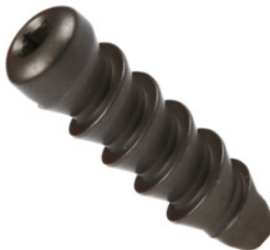
Fig. 3. Helysis Titanium interference screw