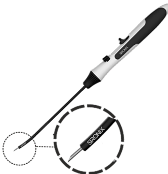
Fig. 4. Surestitch all inside meniscus repair implant