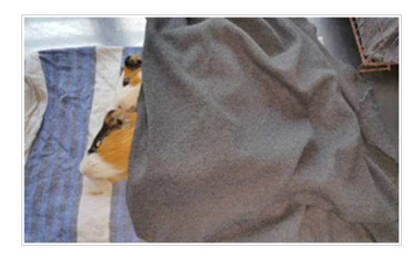
Figure 10 Recovery occurs as: Time of anesthesia was 11.30 AM