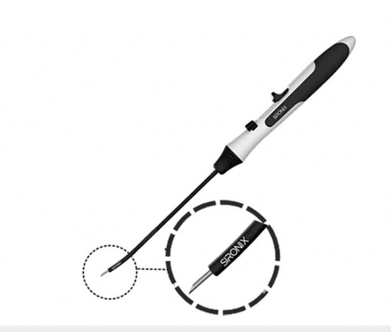
FIGURE 1: Surestich All inside meniscal repair implant

turned to active mode followed by deployment of implants using deployment knob. The needle was retracted carefully and the suture tail was pulled using a knot pusher and cut accordingly. In addition, ACL reconstruction was also performed as an associated surgery in a few patients.