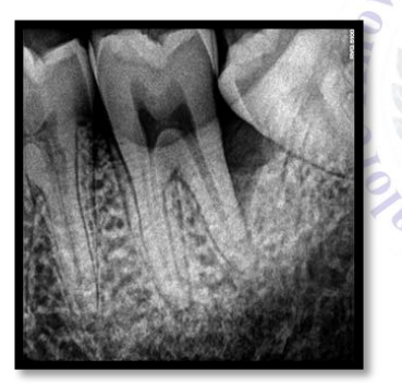
Figure 3: 1year follow up radiograph(left mandibular second molar)

The radiographic density changes were measured using Adobe PhotoshopCS3. There was change in radiodensity (as calculated by histogram using Adobe Photoshop) observed in the defect area suggestive of improvement in newly formed bone.